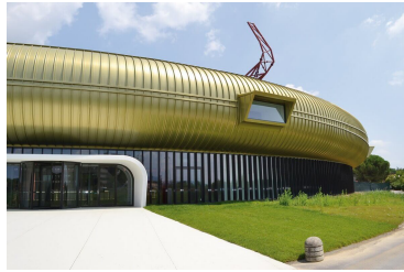
Pecci Center for Contemporary Art