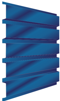
Trapezoidal Profile 50/150