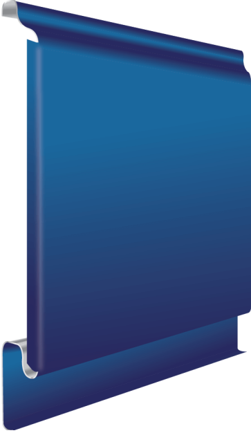
Plank Profiles Bend Edge 25/200 - 25 / 250 - 25 / 300