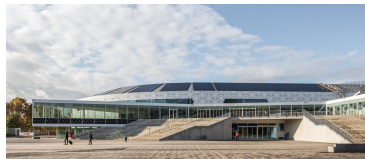
Thialf - Ice Stadium