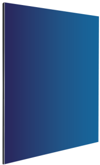
Aluminium Composite Panel Flat